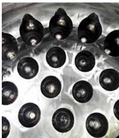
Before Mobilgard 300 C

Its rust prevention and water separation characteristics also make Mobilgard 300 C oil an excellent system oil for use in older-design crosshead diesel engines that have water-cooled pistons.