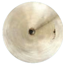
Mobil DTE 10 Excel Series 2,500 hours